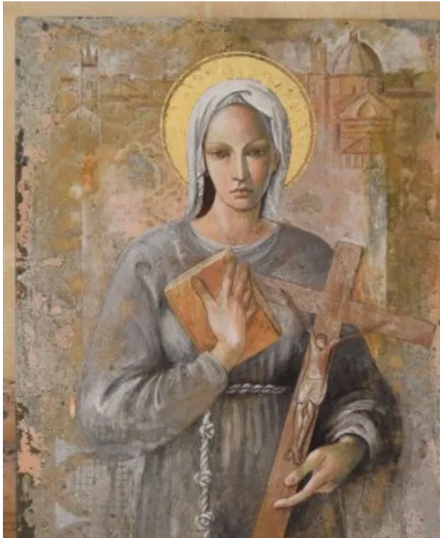
Saint Angela of Foligno, mystic and Patron Saint of widows

Saint Angela of Foligno (1248 – 1309) was born in Umbria, Italy. Married, wealthy, with several children, she eventually put aside all worldly attractions and upon the death of her husband and children, she joined the Third Order, drawing many women of her time to follow her example, eventually forming a religious community. She was renowned for her love of God and neighbour, “especially the poor, and for her humility, patience, and poverty”. She received many heavenly graces and had a special devotion to the mysteries of Christ’s life. Her writings on spiritual topics were so remarkable that she earned the title of ‘Teacher of Theologians’.