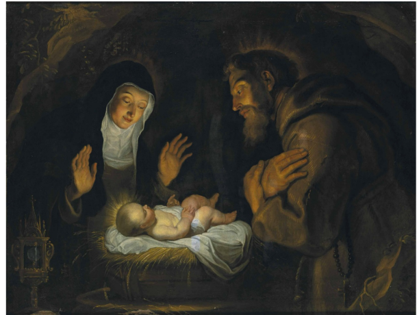
St. Clare and St. Francis of Assisi in adoration before the Child Jesus. Artist: Gerard Seghers 17 th C.