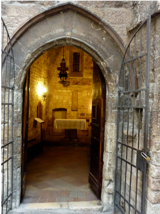
Birthplace of St Francis of Assisi, Assisi, Italy