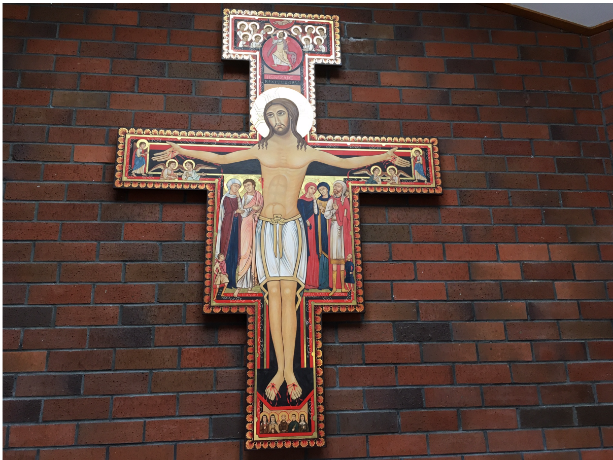
The San Damiano cross above the altar at Saint Francis by the Sea Church, Hibiscus Coast.

suffering and pain. Thus, it is a message of power over evil, victory over sin, hope over despair, resurrection over crucifixion, and love over death, for they are salvific wounds.